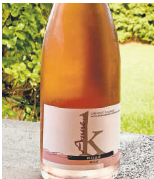
2018 Anne De K Cremant d’Alsace Brut Rose

Vigo: This sparkling rose deserves to be served in a fluted glass. Beautifully pink in color, this wine showed tight bubbles with notes of creamy apples. It’s the taste of the holidays in a glass. As bruts go, it’s dry, but being a brut rose, it’s not so dry that you don’t feel refreshed. At $20 bucks a bottle, its great value for a bottle of sparkling French wine, and it delivers. You will get a