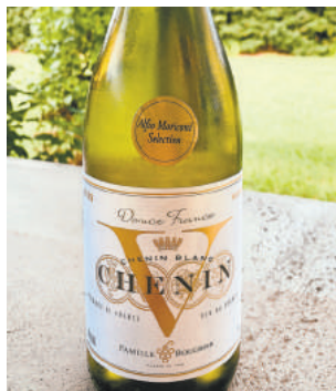
2019 Famille Bougrier “V” Chenin Blanc