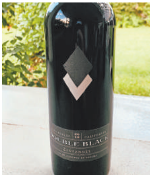
2018 Double Black Zinfandel