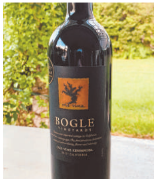
2017 Bogle Old Vine Zinfandel

complimentary raised glass from your guests when you serve this.