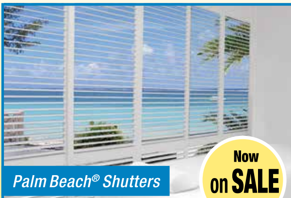
Palm Beach® Shutters

Sliding panels designed for large openings slide back to a small stack. Available in Soft Sheer, Solar screen, Opaque and room darkening fabrics.