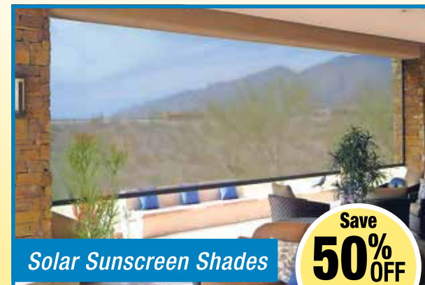
Solar Sunscreen Shades

Smart design in crisp, neat pleats. Our innovative honeycomb construction creates air pockets where light meets color. Available in an impressive range of fabrics, pleat sizes, colors and textures. Assure font matches the other boxes